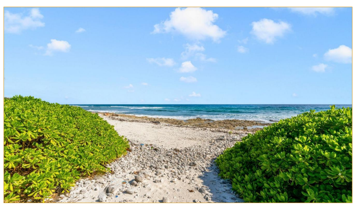
Figure 3 Ground Picture of Azure Breeze – Azure Breeze is in its natural state which is untouched and uncleared.