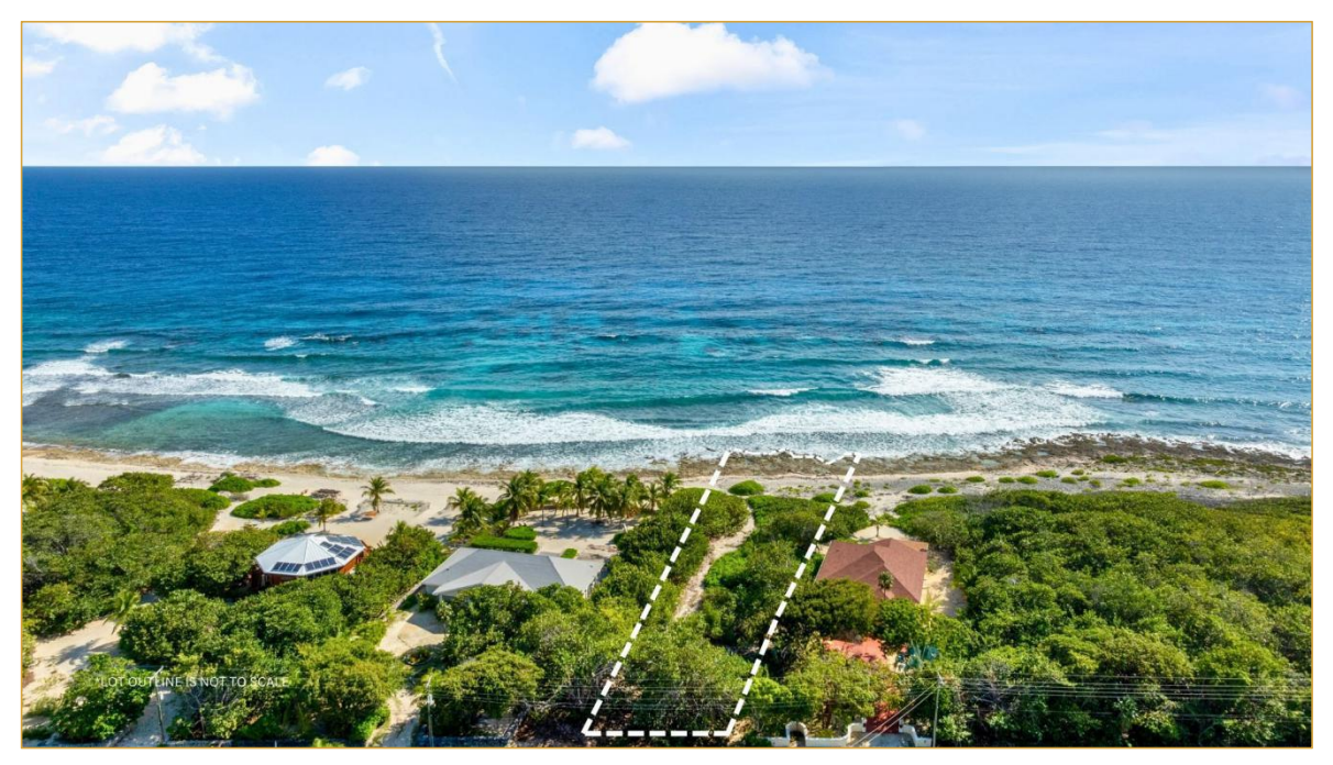
Figure 2 Birds Eye View of Azure Breeze