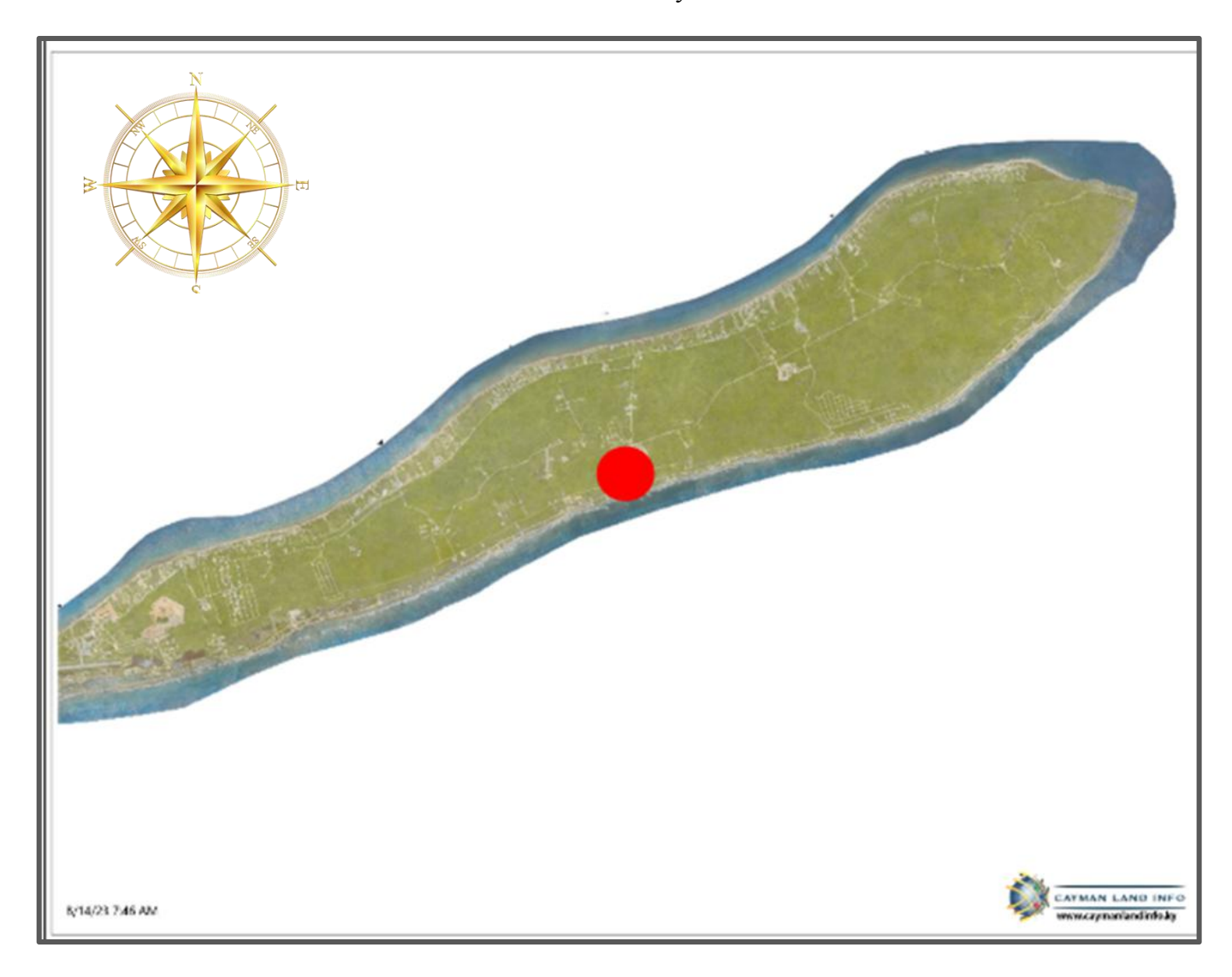
Figure 9 Land Location on Cayman Brac. Document from the Cayman Islands Land Registry Government Website

The below shows the exact location on Azure Breeze on Cayman Brac.