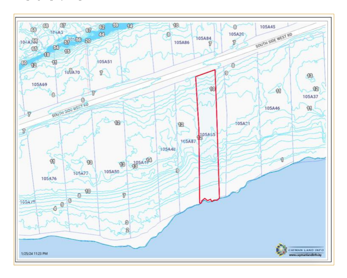
Figure 6 Topography Report showing Height Above Sea Level Direct from the Cayman Islands Land Registry Government Website

Azure Breeze is approximately 10 to 12 foot above sea level according to the Cayman Islands Government land Registry topography report as pictured above.