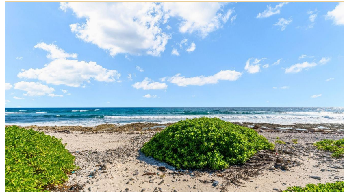
Figure\ 4\ Ground\ Picture\ of\ Azure\ Breeze-Azure\ Breeze\ is\ in\ its\ natural\ state\ which\ is\ untouched\ and\ uncleared.