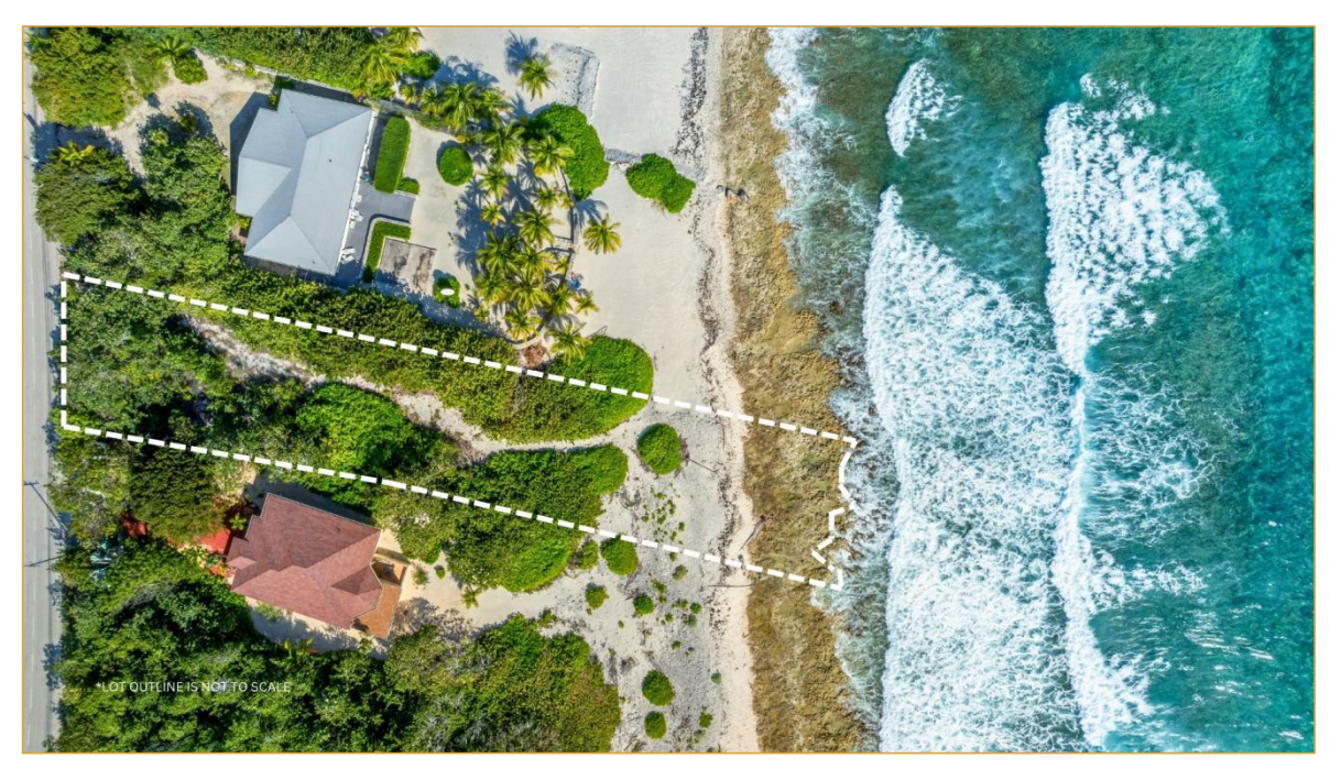
Figure 1 Birds Eye View of Azure Breeze