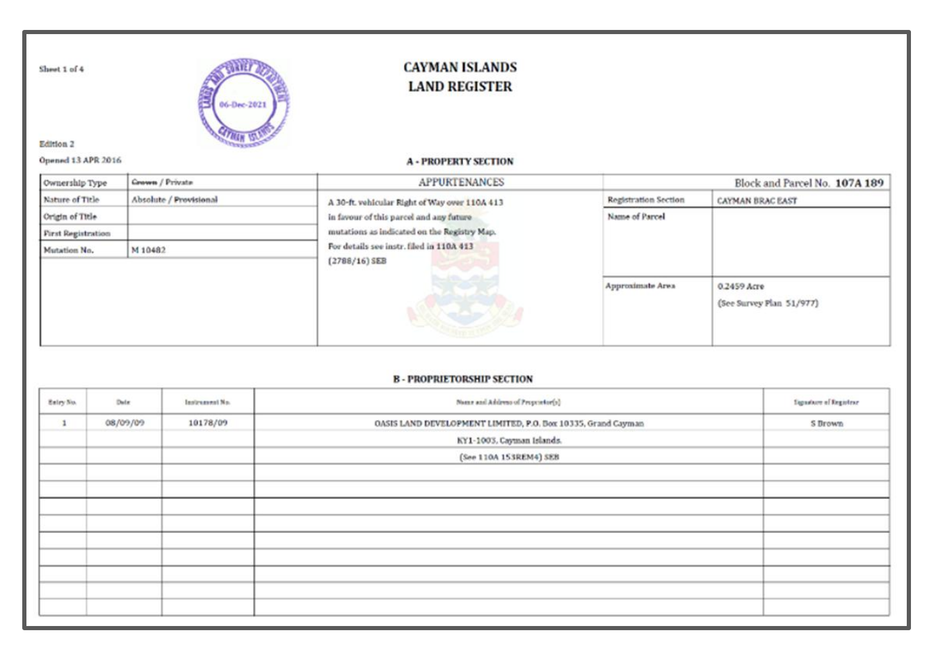
Figure 7 Example Land Registry

The Land Titles Register accurately and completely reflects the current ownership (the Vendor).