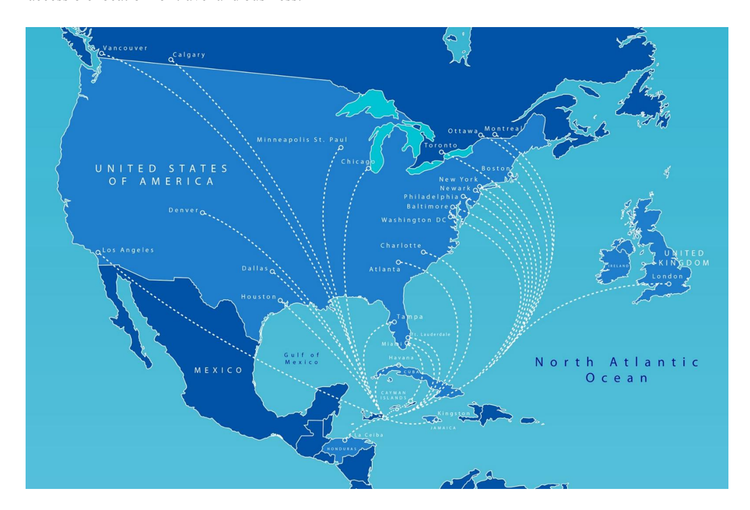
Figure 10 Direct flights to the Cayman Islands correct April 2023

The Cayman Islands are conveniently located to be accessed worldwide, with direct flights available from major cities such as New York, Miami, Toronto, London, and many others. Just a 1 hour flight from Miami. Owen Roberts International Airport, located on Grand Cayman, is the main airport for the Cayman Islands and is serviced by several international airlines. The airport offers easy connections to other destinations in the Caribbean, North and South America, Europe, and beyond, making the Cayman Islands a highly accessible location for travel and business.